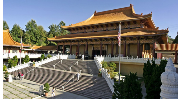
Hsi Lai Buddhist Temple