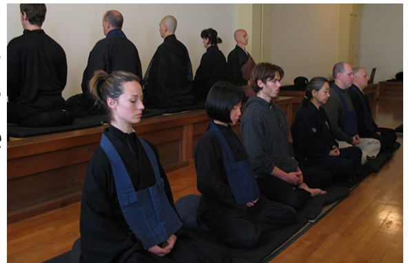
San Francisco Zen Center