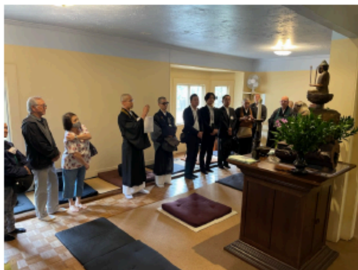
Visiting Zen Center of Los Angeles